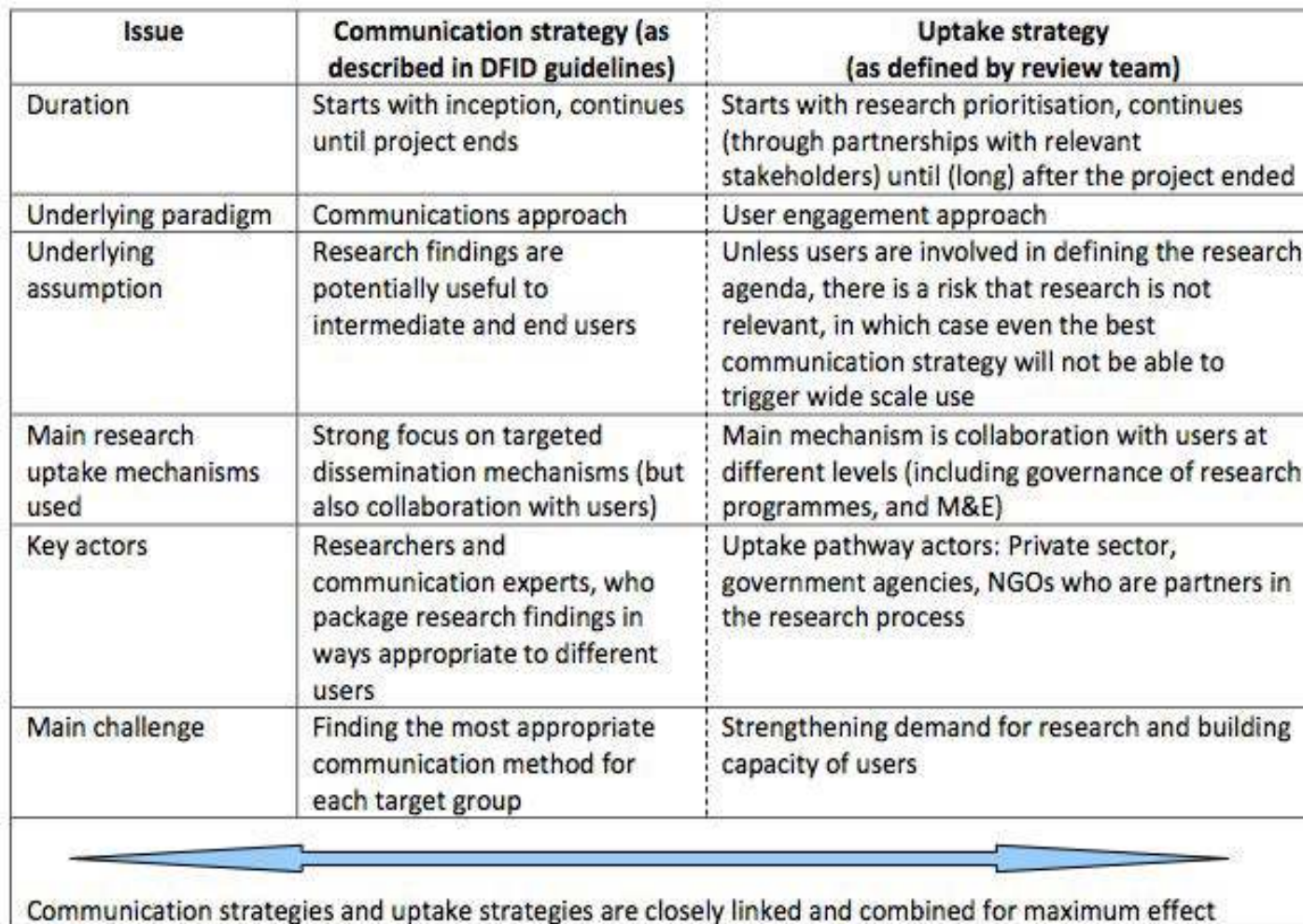
Table 1: Differences and commonalities between 'research communication' and 'research uptake' strategies. Adapted from Adolph et al 2010, p 62.